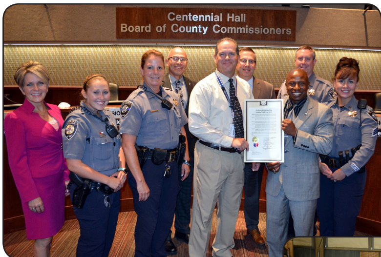
The Board of El Paso County Commissioners recognize the 35th annual National Night Out held in August of 2018. National Night Out is a positive, proactive opportunity for El Paso County to join forces with thousands of other communities across the country in promoting cooperative police-community crime prevention efforts.