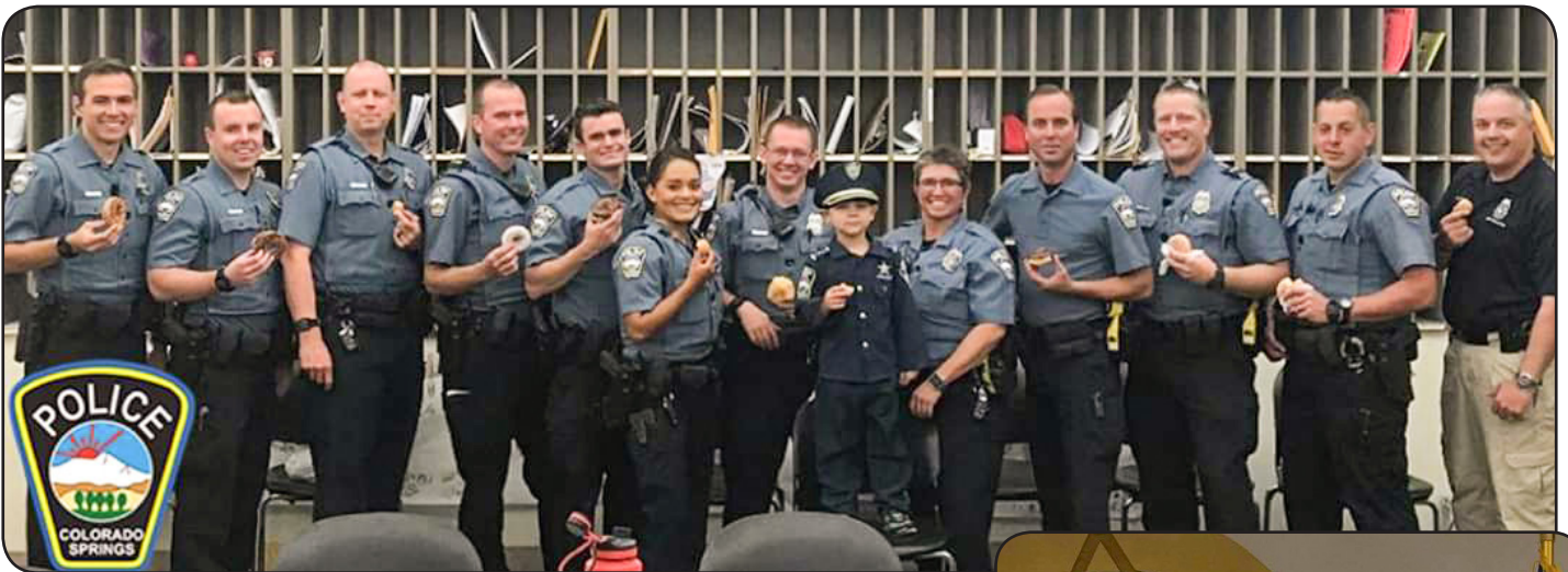
Colorado Springs Police comically enjoy delicious donuts.

Please visit the Criminal Justice Coordinating Council website at https://communityservices.elpasoco.com/community-outreach-division/justice-services/criminal-justice-coordinating-council