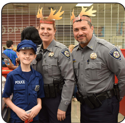
El Paso County Sheriff's Deputies participate in the Shop With a Cop program at Target in December of 2018. The annual holiday event helps build positive relationships by pairing officers with elementary school students as they shop for holiday gifts for their families with gift cards donated by police and retailers.

El Paso County's departments of Human Services, Planning and Community Development, and Public Health were recognized in July of 2018 with Achievement Awards from the National Association of Counties (NACo) for innovative and effective county government programs that strengthen services for residents, including a program to help support court-involved clients in receiving Health First Colorado assistance.