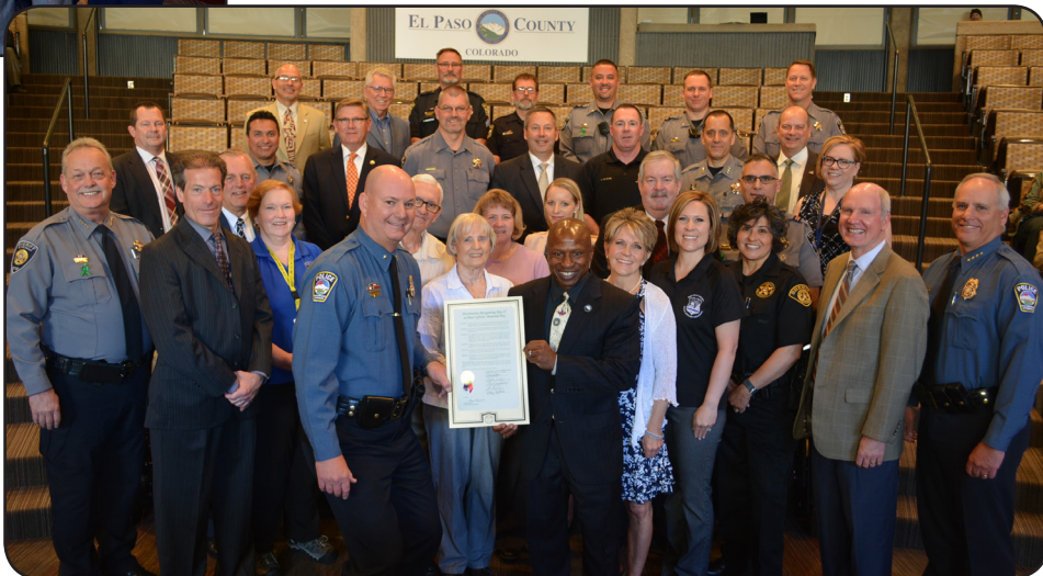
The Board of El Paso County Commissioners recognize the dedication of the Peace Officers Memorial in May of 2018, honoring officers killed in the line of duty in El Paso and Teller Counties since 1895.